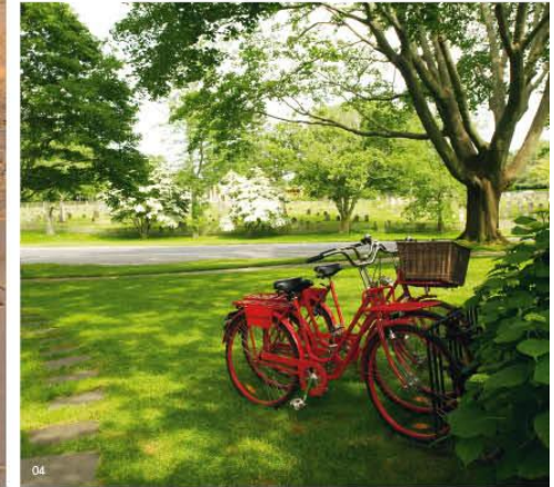
02 c/o The Maidstone gardens 03 Chic shopping in Southampton 04 Coopers Beach in Southampton Photos 02 & 03 courtesy Long Island CVB 04 Vintage bikes at c/o The Maidstone 05 Montauk Yacht Club Resort & Marina