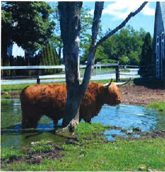
Animal life on the North Fork.

tasting room beckoned. With a vaulted ceiling and adjacent gift shop selling every conceivable wine accessory ever made (who knew a corkscrew could look like that?), it's worth the trip.