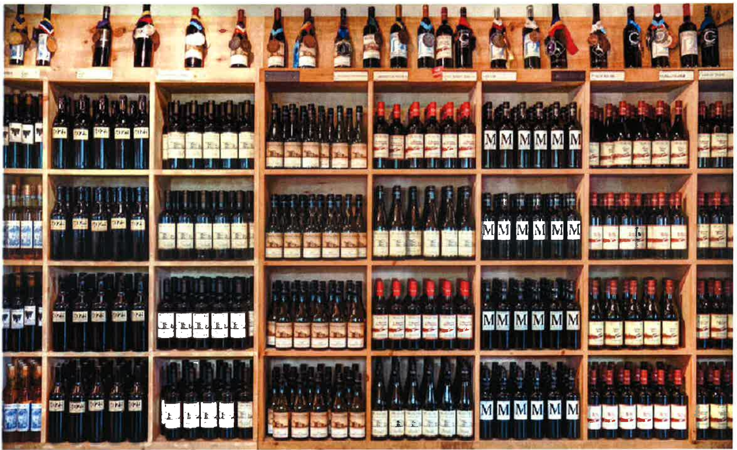
Clockwise from top of opposite page: The vineyards at Martha Clara, a lunch spread at Laurel Lake Vineyards, a wall of award-winning wines at Martha Clara Vineyards, taking a break from cycling back on the road.