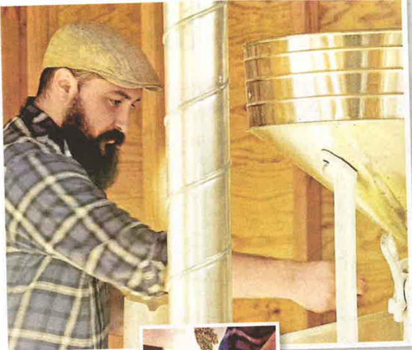
Island Beverage Trail.