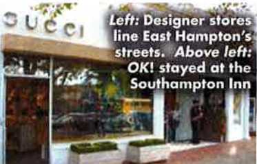
Left: Designer stores line East Hampton's streets. Above left: OK! stayed at the Southampton Inn

For some serious bargains head to the island's North Shore to the Tanger Outlets in Riverhead. You'll find hundreds of shops including Juicy Couture, Ugg and Calvin Klein. In Southampton, 200 boutiques housed in whitewashed, wooden houses line the leafy streets. In East Hampton browse big names such as Tiffany & Co and Gucci as well as Ralph Lauren and his daughter's candy shop Dylan's, where Apple Martin likes to shop.