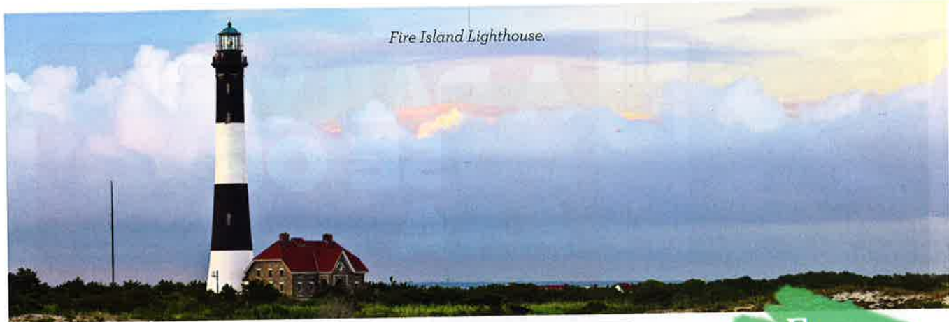
Fire Island Lighthouse.