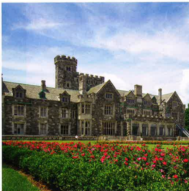
Hempstead House at Sands Point Preserve.

Lunch Break: Dig into the seafood dishes at Louie's Oyster Bar & Grille in Port Washington, which has outdoor tables overlooking Manhasset Bay.