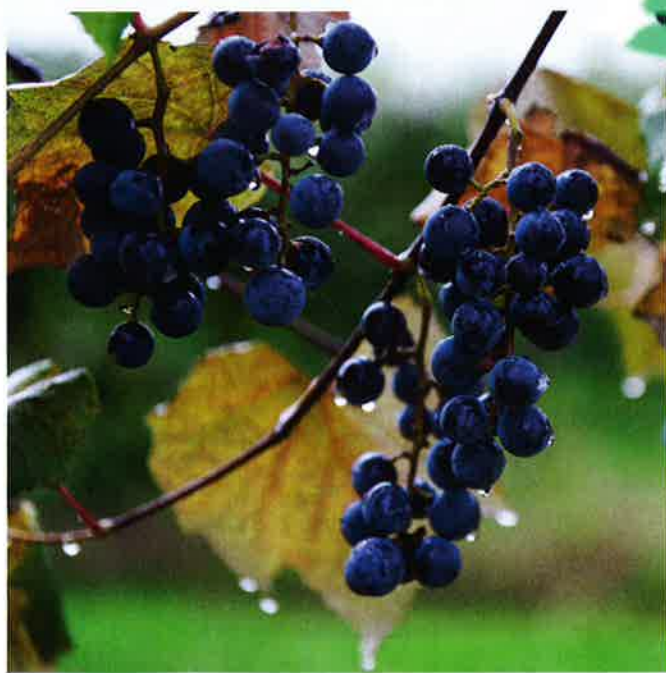
Grapes on the vine at a Lake Erie vineyard.

Lunch Break: In the town of Mayville, on Lake Chautauqua, is Webb's Captain's Table restaurant—ask to be seated in one of the wooden booths.