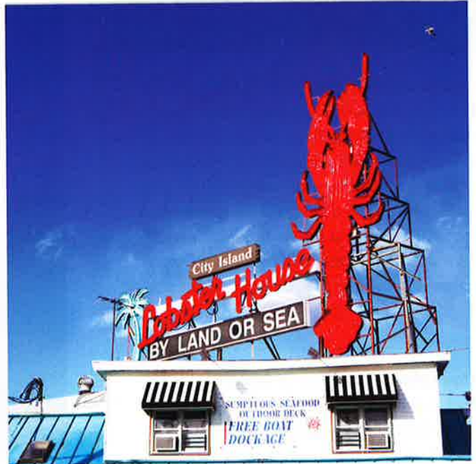
The City Island Lobster House.

Lunch Break: There are seafood restaurants galore here so you can't go wrong—the Sea Shore and the City Island Lobster House are popular spots.