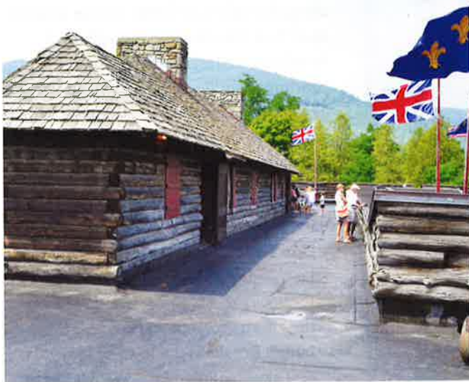
Fort William Henry in Lake George.

The forts on either end of 32-mile-long Lake George are rich in history. At Fort William Henry (on the southern end) you can tour the rooms of the former British outpost and watch daily musket firings, while at Fort Ticonderoga (on the northern tip) you can learn how the star-shaped fort was captured from the British in 1775 during the Revolutionary War.