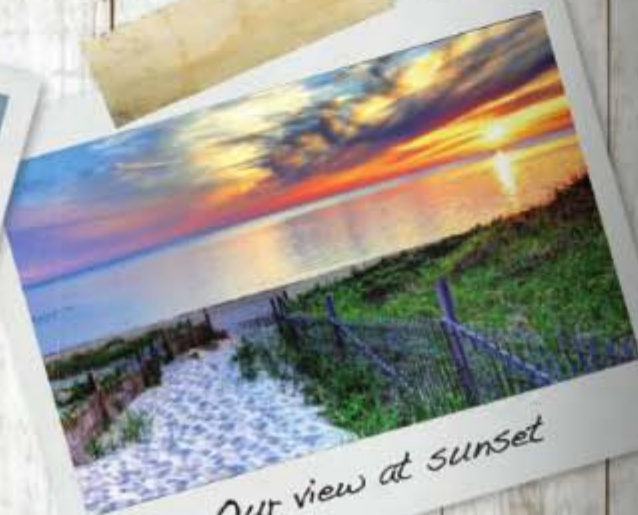
Our view at sunset