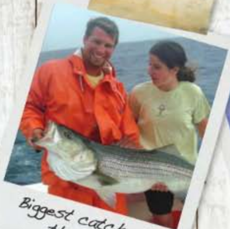
Biggest catch of the day!