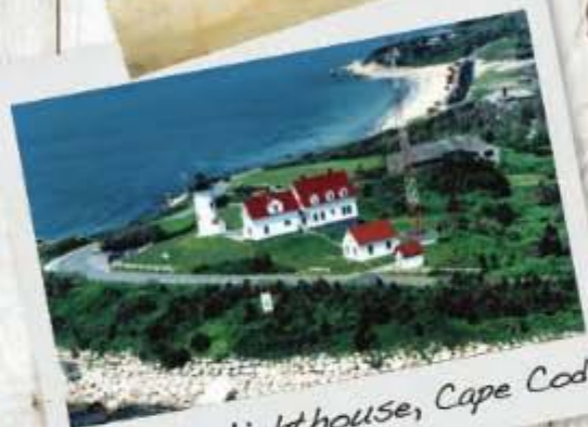
Nobska Lighthouse, Cape Cod