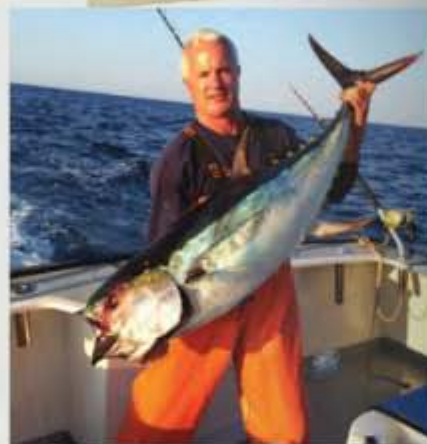
Blue fin tuna at the Cape