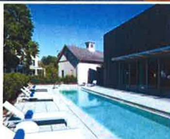
Top and bottom: Mixing heritage styles with beach modern, Topping Rose House in Bridgehampton appeals to the urban crowd

Then save the best for last, Montauk: surfer dudes, Warhol's favoured haunt, where the Stones wrote Memory Motel , hipsters from Brooklyn. This year's hottest spots are the Montauk Beach House – fashionista HQ – and Rushmeyer's, with its Caribbean vibe. Solé East, a 1960s motel on the beach, is cheerful but not cheap. The Navy Beach restaurant, on a private beach,