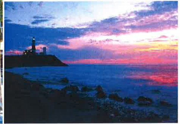
The American Hotel, Sag Harbor; Montauk Lighthouse faces west out over the Atlantic; Rushmeyer's in Montauk has a nautical theme; legendary Lobster Roll in Amagansett; modern 'glass box' architecture is a striking contrast to some of the more traditional old-money residences in the Hamptons