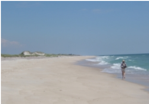
Moses State Park

Just a commuter train ride from Manhattan, Long Island is the biggest island in the contiguous United States. It really is long - 118 miles, including Queens and Brooklyn. Close to the city is Nassau County; beyond it, Suffolk County has the famous glitterati playground, the Hamptons, and 30 family-owned vineyards and wineries. Long Island has gorgeous powder sand beaches, great aviation landmarks, fishing and seafaring towns, a completely different world from the heart of the city. Although the 118 miles serve up plenty of activities, my Fave