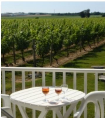
Long Island Vineyard

To taste a real sampling of the wines of Long Island, The Tasting Room, in a tin-walled 1860s building, is the only one where a number of vineyards have a cooperative tasting room, with artisan vintages from ten Long Island wineries. If you'd like to explore the wines further, Peconic is within 20 miles of nearly all the Long Island vineyards, and when colder weather comes, Jazz on the Vines brings live music to the wineries.