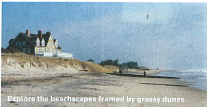
Explore the beachscapes framed by grassy dunes

adventures and timeless pastimes. Nestled in the Adirondacks, small towns and villages brim with hometown appeal, while the city of Glens Falls provides a vibrant cultural hub. In the Lake George area, there are more than 20 lakes that are prime for outdoor sports, including river tubing, swimming, kayaking, and boating.