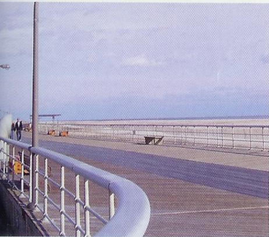
■ Jones Beach Broadwalk